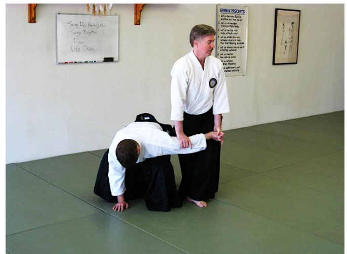
The author teaching jujutsu

In shodo , the character for ichi ("one"), which consists of nothing but a single horizontal line, is