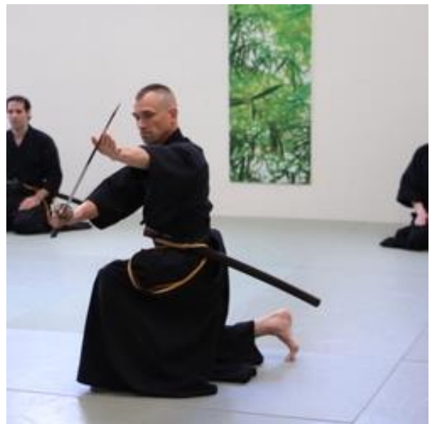
The author teaching iaido

In Mihaly Csikszentmihalyi's Flow , he describes how there is a state where an "optimal experience" or