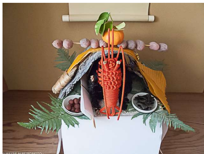
A Japanese New Year decoration

The kasane mochi is part of a larger decoration in the family tokonoma ("alcove"), or, in the case of a dojo, the kamidana . It can be as elaborate or as simple as you want the decoration to be. A citrus fruit would be placed on top of the two stacked kasane mochi , called a daidai . (This is a play on dai-dai , meaning "generations upon generations.") Not having this fruit, which is native to Japan, Japanese in Hawaii use a tangerine, or mikan , which is about the same size and flavor. Other decorations adorn this basic setup. For example, you can further decorate this arrangement with dried persimmons (a play on words for "joy"), woven yarn lobsters or shrimp (the bent back of the crustaceans signifying longevity), and so on. A tea sensei I know would decorate his alcove with a mound of raw rice, topped by three cut pieces of cylindrical charcoal, tied together, with a single pine branch sticking up