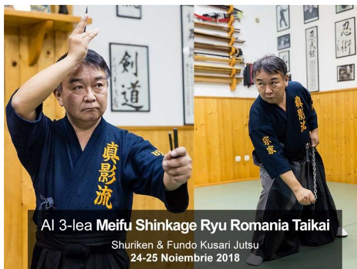
AI 3-lea Meifu Shinkage Ryu Romania Taikai