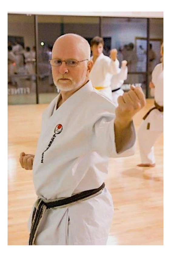
Kosslow Sensei teaching Wado Ryu

If you can face up to your sensei when he looks you straight in the eye, and you know pain is forthcoming, then you aren't going to be scared of other people. They can't possibly do anything to you like your sensei has already done.